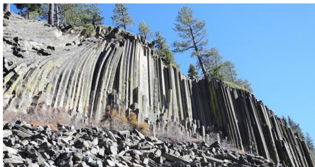
Basalt columns - Eastern Sierras