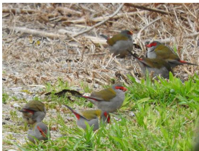
Red-browed Finches.