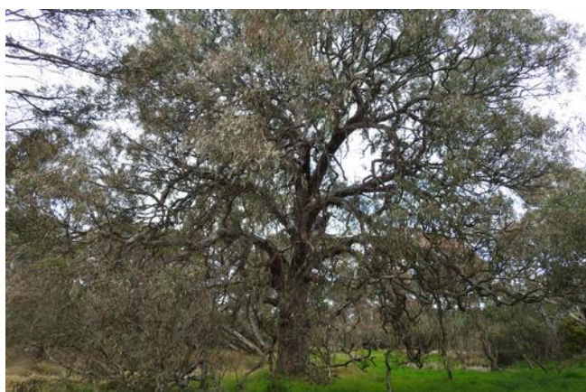
Ancient River Red Gum.

Following our visit to The Grange Bushland Reserve we moved across to Braeside Park, where we were met by ranger Des Lucas, who gave us a brief talk before he had to head off to another park, not before admitting us to the Heathland Conservation Area. The vegetation here was not as diverse as at The Grange, but there was plenty to interest us, including the reputedly 800 year old river red gum, and a single orchid ( Pterostylis nana ). Braeside is more about birds though, with over 40 species noted.