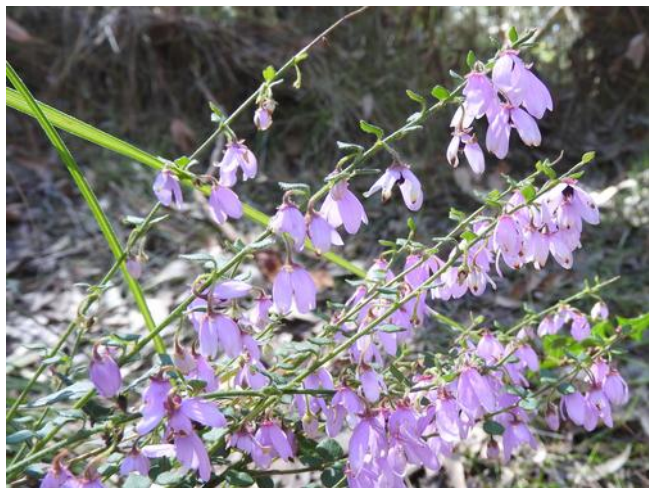
Pink Bells.

The dam was built by the O.T. Cordial Company in 1934. This company, which later became Kia Ora Cordials, produced a chilli-flavoured cordial, called O.T., and built the dam to irrigate their crops in the land below the dam. The business closed in the 1940s (this information from https://www.visitmorningtonpeninsula.org ). There is some trade among collectors in the embossed bottles from early last century.