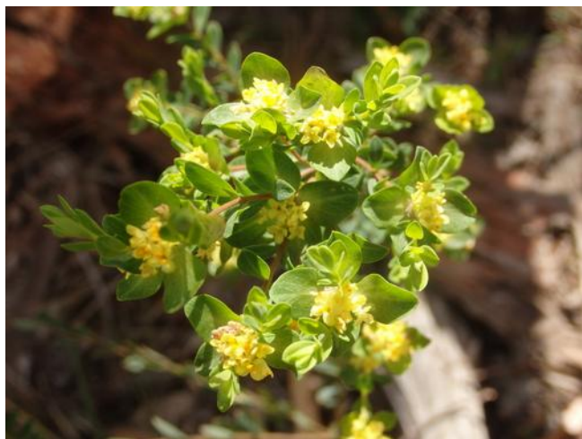
Pimelea flava.

One perfect Spring day, mild and sunny, we set off for Karwarra Gardens at Kalorama, near Mt Dandenong. The Gardens didn't open till 1 pm, so we popped into Baluk Willem NCR, Courtneys Rd South Belgrave on the way. We usually go there a month earlier, when the orchids are in full season, so it was interesting to see it later in the spring. There were a plethora of yellow flowers – Pimelea flava , Hibbertia riparia , Goodenia geniculata , Coronidium scorpioides (button everlasting), Tricoryne elatior (Yellow rush-lily), Lomandra filiformis and L. multiflora , and Acacia mearnsi , as well as white Pimelea humilis , pink Trigger plants and Xanthorhoea minor (grass trees), all in flower. We found two orchids – the Microtis - Onion orchids had gone to seed, and there were a couple of very late Lyperanthus suaveolens (Brown beaks). Kunzea leptospermoides (Burgan) was in full flower and attracting a great many beetles, ants, bees and butterflies. Sword grass brown and Common brown butterflies added to the scene. It was a fleeting visit, so only a few birds seen - Yellow robin, grey and pied currawongs, rufous and golden whistlers, fan tailed cuckoo, little raven, grey shrike-thrush, kookaburra and brown thornbill.