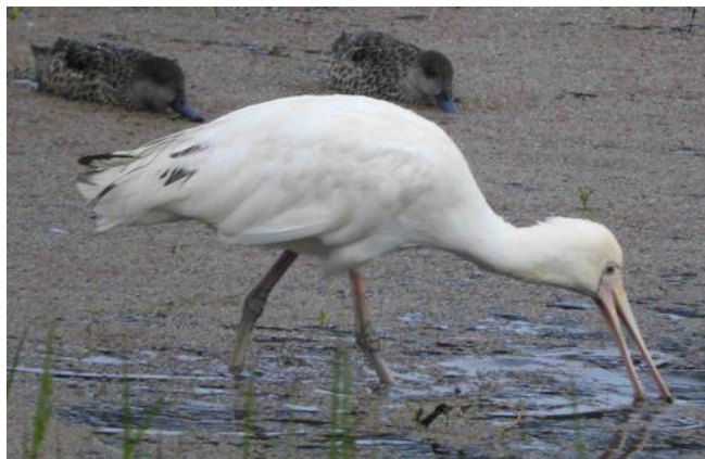
Yellow-billed Spoonbill.

About 50 Yellow-tailed Black Cockatoo flew over in small flocks with the noise that muted even the kookaburras' calls. At the top of one dead tree a Black-shouldered Kite was proudly observing its territory. A pair of Australian King Parrots were calling each other and carefully watching us during our lunch break.