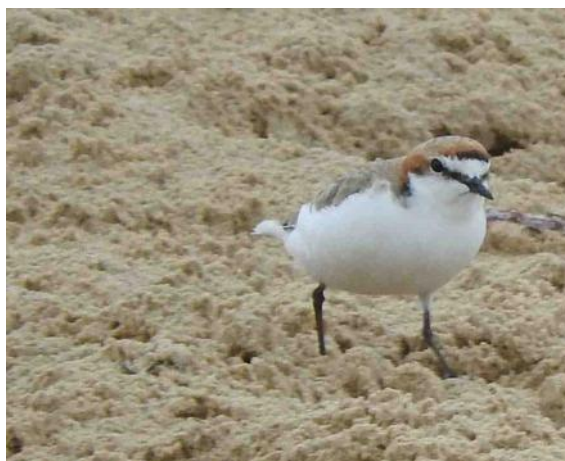
Red-capped Plover.

In the end, the highlight of the day was the crossing of the Merricks Creek and reaching Westernport. Instead of just billboard pictures and cautions: "Red-capped Plover nesting area ahead" that we saw in our previous visits to the place, this time we saw the real thing. Ten Red-capped Plovers were running, flying up and down around us. With reddish-brown crown and back-neck they are easy to distinguish and see despite being only 15 cm in length 30 cm in wingspan and weighing only 35-40 g.