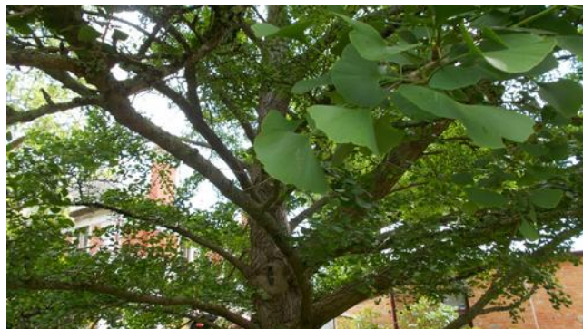
Ginkgo [Maidenhair tree]

It is the only living species in the division Ginkgophyta, all others being extinct. It is found in fossils dating back 270 Million years. — Velimir Dragic