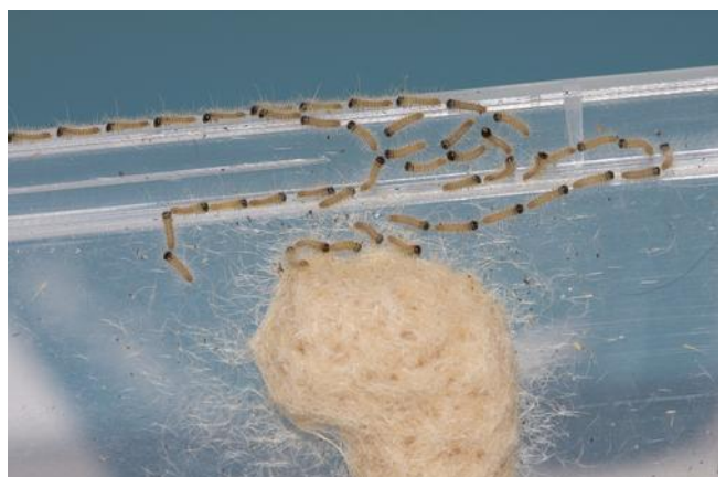
Larvae (first instar)