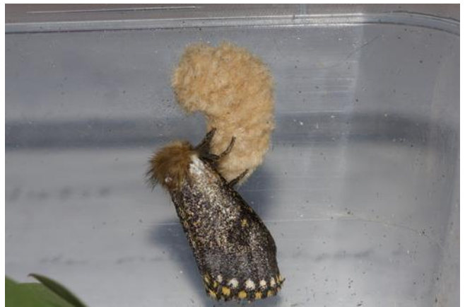
Female with first egg sac