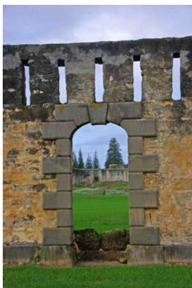
Gaol Gate, Kingston

About 18% of the Island is National Park, managed by the Australian Government, with a number of smaller reserves, including a Botanic Gardens, managed by the local government. Before human settlement the vegetation consisted of sub-tropical rainforest. About one-third of the vegetation is of New Zealand origin, with 180 or so native plant species, 43 being endemic. This number compares with 377 introduced plant species. The most famous plant is of course the Norfolk Island Pine ( Araucaria heterophylla ). A strong garlic odour is emitted by a tree called Sharkwood ( Dysoxylum bijugum ). There are a number of endemic ferns, as well as some familiar species such as the Bird's-nest Fern ( Asplenium australasicum ). The Phillip Island hibiscus Hibiscus insularis is endemic to that island.