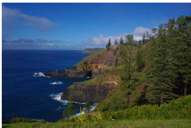
North Coast Cliffs.

Heather visited the Island with her husband a few years ago. The Island is about 8 x 5 kilometres, and has only one town, Burnt Pine. The topography consists of a system of ridges radiating from a central high point, with a plateau about 90 to 100 metres high. The coastline is almost entirely cliffed, with very few beaches. There is one area of coastal lowland, which is where the convict settlement was established. Nepean Island, Phillip Island and Rocky Islets, off the north coast, are included in the Norfolk Group, Norfolk and Phillip Islands being volcanic, part of the Norfolk Ridge that extends from New Zealand to New Caledonia. Volcanic activity ceased about 2.2 million years ago.