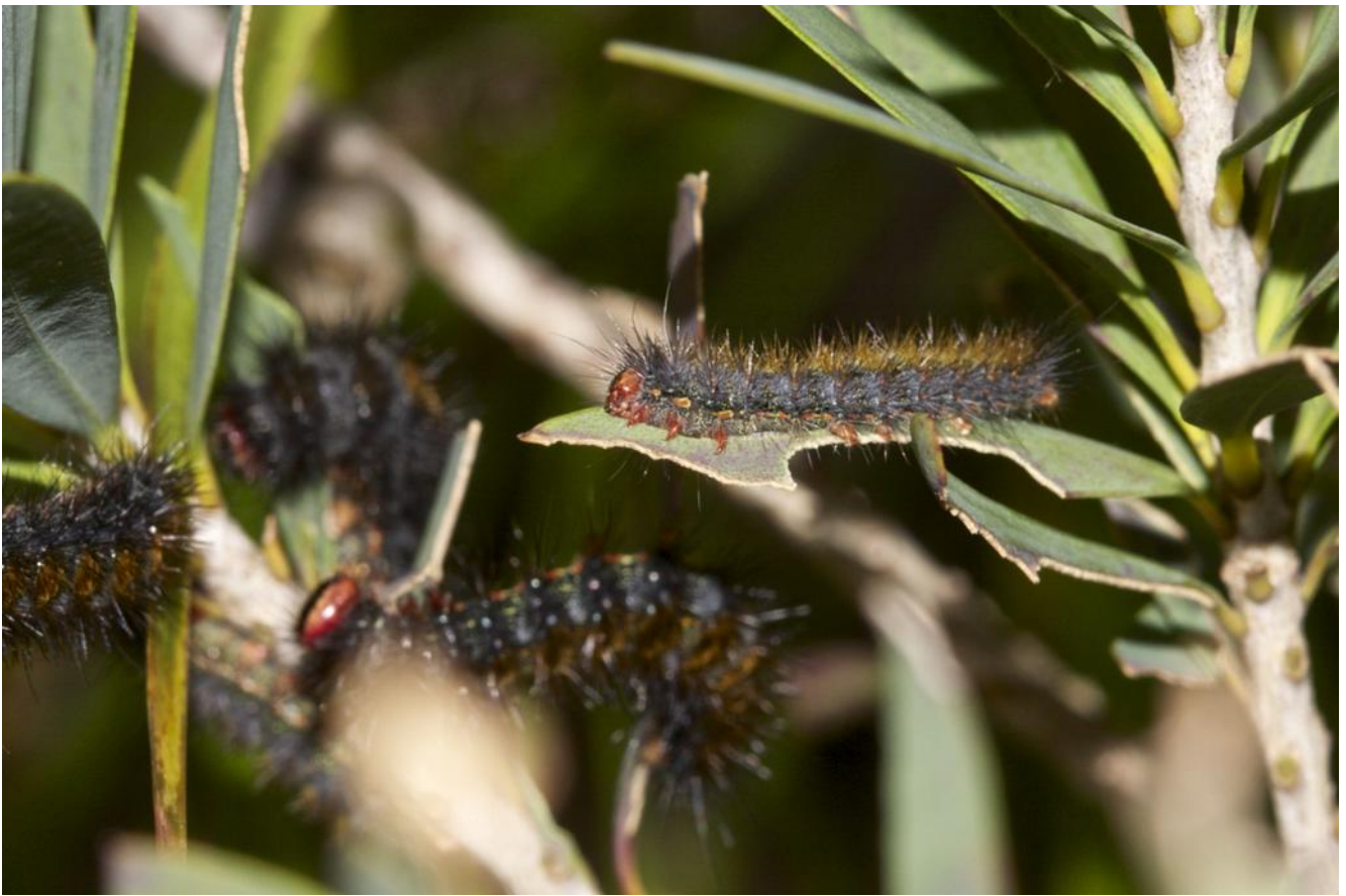
Larvae (late instar)