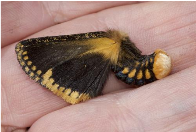
Female 'playing dead'