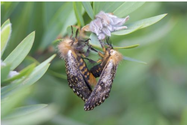
Mating pair with female on the left