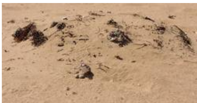
Red-capped Plover at nest (foreground)

capped Plovers of Western Port, as it was felt their population is in decline, but there was not much information about them. They are more common than Hooded Plovers, and nest on inland lakes, salt marshes and wetlands as well as beaches. Two populations were monitored – Pt Leo/Shoreham and Balnarring. Their territories were walked twice a week, and numbers of birds, nests, eggs, fledglings and also threats such as dogs off lead were recorded. They were challenging to monitor, as they are more mobile than Hooded Plovers, and move up and down the beach, and are also keeping company with Red-necked Stints, who look very similar. One way to tell them apart is their feeding action – the Red-capped Plovers run and peck, the Red-necked Stints have a sewing machine action.