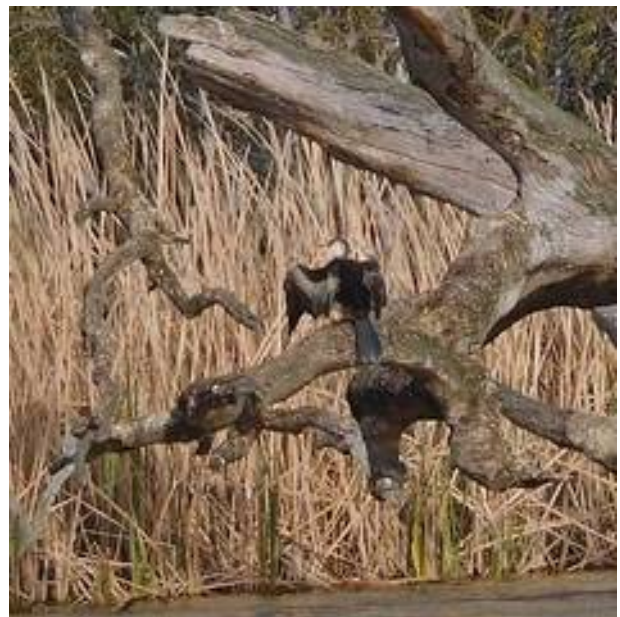
Darter at Melton Botanic Gardens.

There were actually more birds at the Gardens than in Long Forest, including several honeyeaters, Red-rumped Parrots and a Darter. We were amused to note that the houses across the road had practically no gardens at all — I suppose there is no need to maintain your own garden when there is such a wonderful garden across the road. Access to the Gardens is not restricted, and some picnic facilities are available.