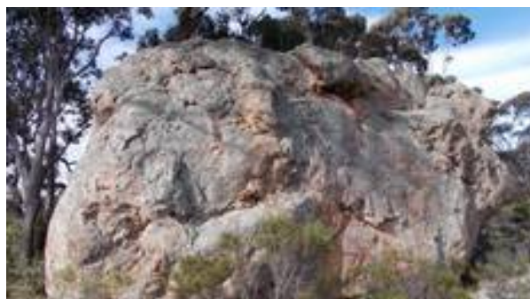
Newer volcanic outcrops on "Mallee Track" in Happy Valley