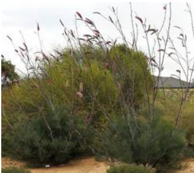
Grevillea magnifica at Melton Botanic Gardens.

On the way home we stopped in at the Melton Botanic Gardens. These gardens are fairly new, created by volunteers over the last seven or eight years. They are heavily, but not exclusively, planted with Australian native plants, including a good selection of Grevilleas and a Eucalypt arboretum featuring a number of Western Australian species. There is also a large wetland area next to the Western Freeway, with an expanse of open water. fed by Ryans Creek.