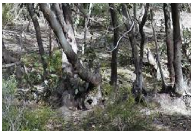
Lignotubers of Bull Mallee.

On a fine mild day, albeit with an at times gusty wind, two carloads of Field Nats set out for Long Forest Nature Conservation Reserve, just out of Melton. As usual, getting through the city was the first task; once this was accomplished we could begin to enjoy the day. The Reserve covers 600 hectares, and contains part of an unusual mallee community.