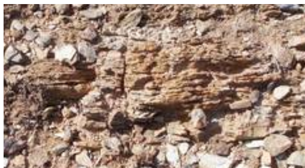
A sedimentary slate on "Gravelly track"