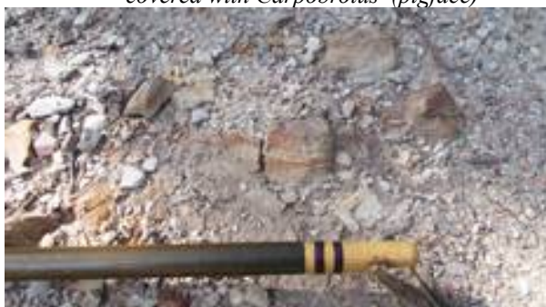
Deformed soft-sediment structures in glacial-marine sediments