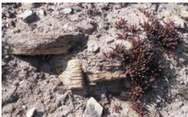
Grey glacial deposit and sedimentary slate on creek bank covered with Carpobrotus (pigface)