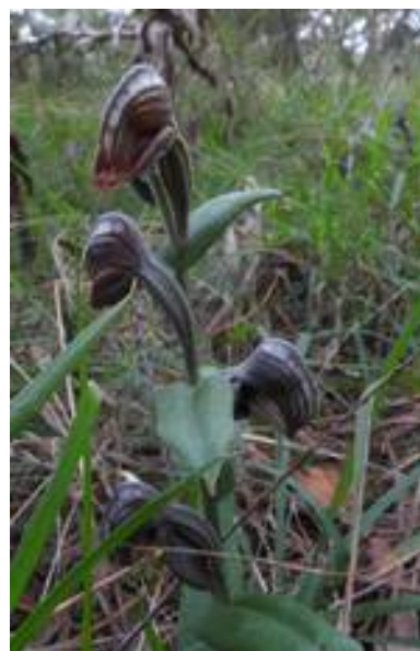
Pterostylis sanguinea.