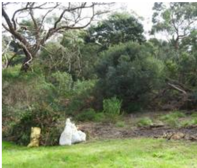
Our morning's work.

Wallace Reserve is a 3.7 ha reserve amongst houses between Heatherhill Rd and the Stony Point rail line. For our annual Club working bee we joined the Friends group for a session of weeding in preparation for a planting day involving local schoolchildren. About ten volunteers in total spent a few hours clearing an area along Wallace Avenue, removing mostly exotic grasses and African Ivy. After a short guided walk around the Reserve a sausage sizzle was our reward.