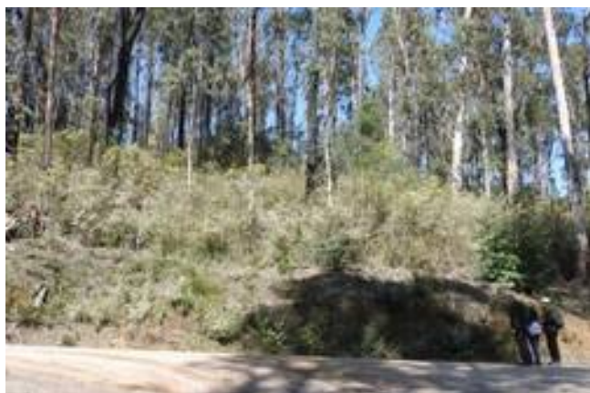
Roadside vegetation.

We started at Nangara Reserve, an ex-quarry, then moved on to Lawson Falls picnic area, but not the Falls themselves.