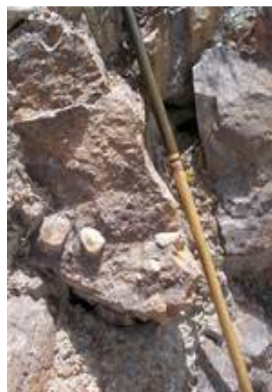
Tillite – Bacchus Marsh formation

Another 100 MY later, [in the Permian Period], a movement of a huge ice-sheet collected, transported and dumped a mix of mud and stones, forming tillite . It is a conglomerate of quartz, granite, other various, irregular stones and mud, hardened into sandstone – called Bacchus Marsh formation .