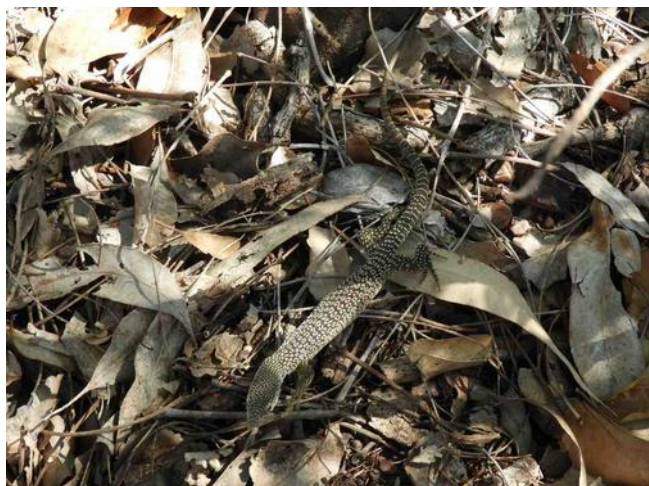
Spotted Tree Monitor.

tourists. The majority of the tourists were in a hurry to get from the carpark to the swimming holes without much concern for the environment they were travelling through. We ambled along the paths looking and listening and were rewarded numerous times with the sightings of both flora and fauna that we hadn't seen before. One being the Spotted Tree Monitor.