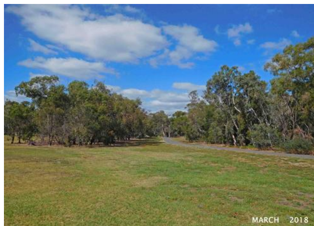
Some before-and-after views, Downs Estate.