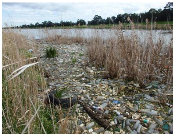
Contrasting scenes along Patterson River: Whistling Kite - photo by Heather Ducat; Accumulation of plastic waste - photo by Judy Smart