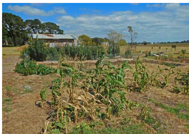
The Community Garden.