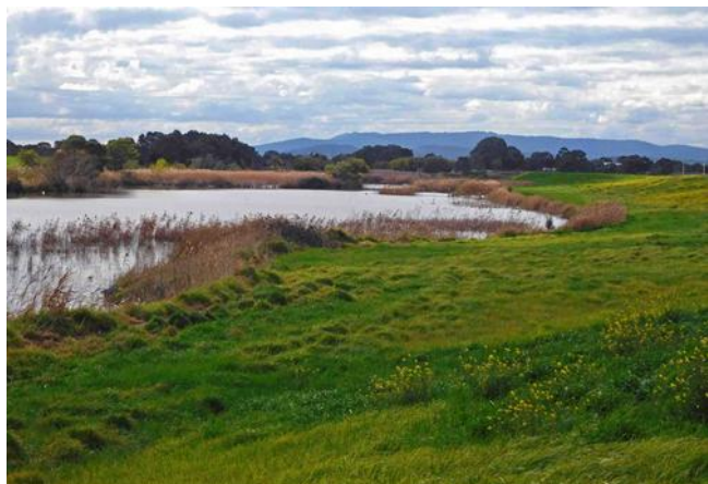
Patterson River above the Water Sports Centre.

The weather was fine, overcast at first with a blustery northerly wind; later the clouds cleared from the west, over the Bay, bringing sunshine. This route was familiar to some of the group, but was new to most of us. The birdwatching was exceptional.