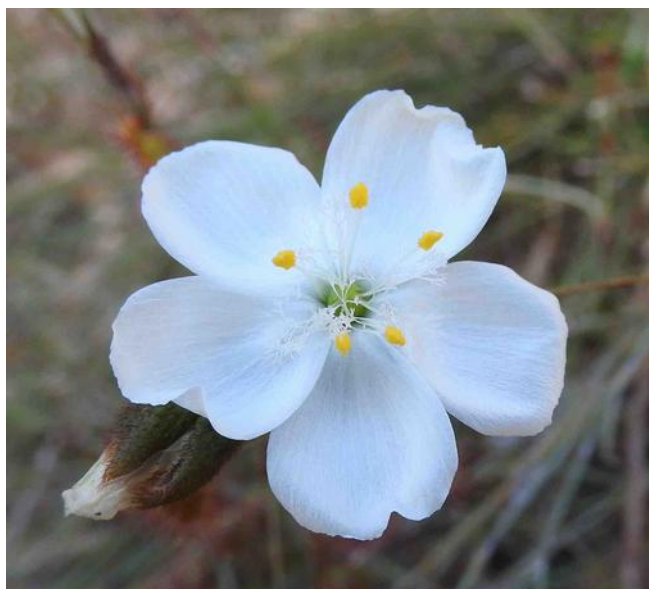
Drosera macrantha .

There is a network of paths through open Eucalyptus viminalis woodland on the hilltops, down to wetter lower areas mainly vegetated with Melaleuca squarrosa and M. ericifolia . It was also noticeable that there were very few weedy species — the odd Pittosporum and Sallow Wattle, and some weedy grasses — incredible considering that the vegetation of the adjoining McLelland Gallery seems to consist almost entirely of weeds!