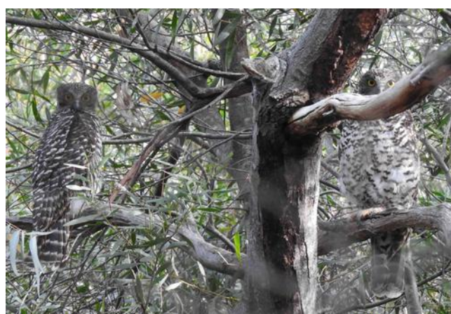
Powerful Owls at Langwarrin FFR.

Most of the birds studied have been in the Yarra Valley and Mullum Mullum Creek area, where the birds have close home ranges – 11 territories so far. By doing this study they are finding more records than previously available through Birdata and other sources.