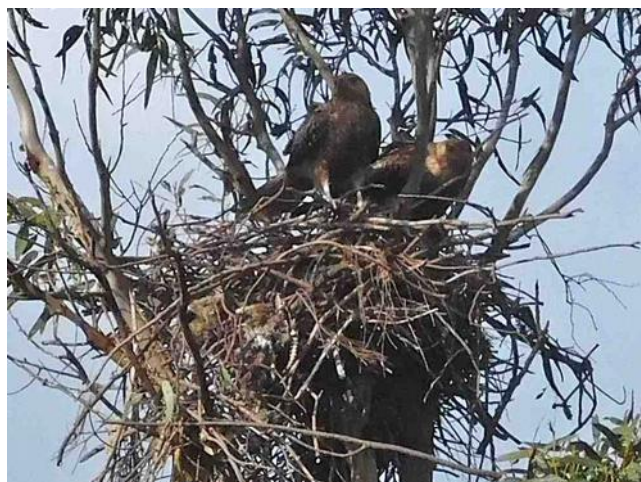
Whistling Kites on nest.

There was nothing left for it now but to walk the 5 kilometres back. On the return trip the Whistling Kite nest — with two Kites in residence — was spotted. Other raptors sighted during the walk were Swamp Harrier, Black-shouldered Kite and Nankeen Kestrel.