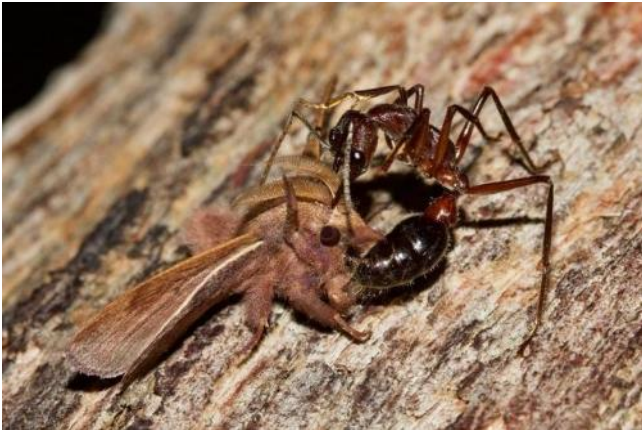
Myrmecia sp. ant inflicting its sting into a Lappet Moth

can also hurt with a painful sting as is depicted with this Myrmecia (one of the M. gulosa group) ant inflicting its sting into a Lappet Moth ( Pararguda rufescens ) pictured below.