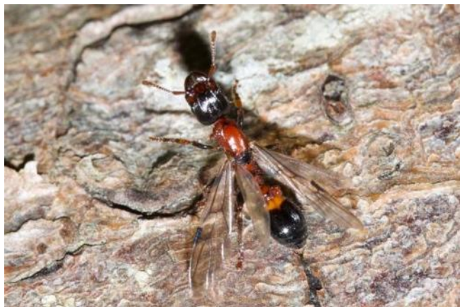
Musclemen Tree Ants (Podomyrma sp)

site, or in things like cracks in trunks, or large seeds and galls. As with the bull ants, they forage alone and are omnivores.