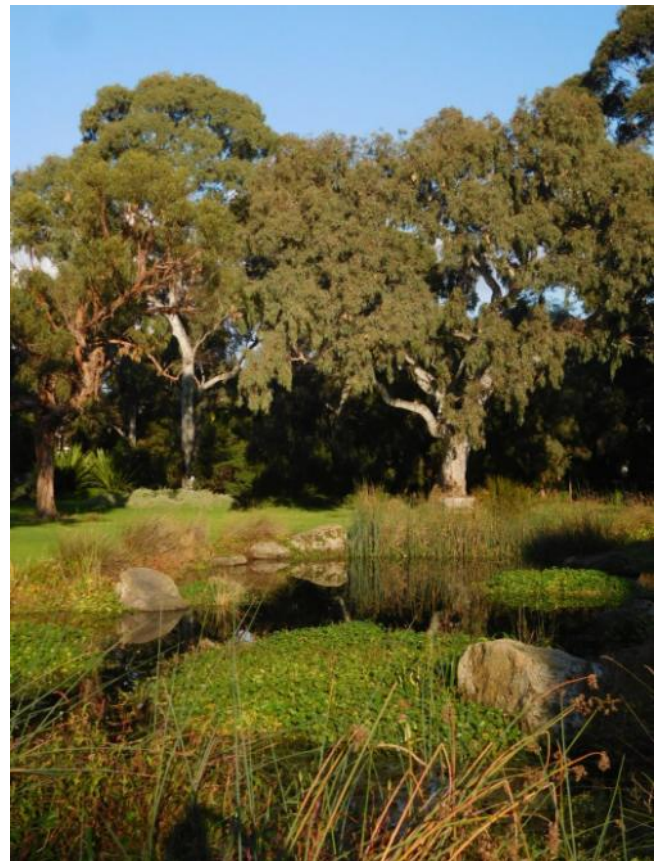
Australian Native Garden.