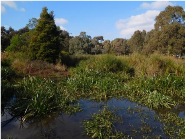
Trin Warren Tam-Boore Wetland.

Heather planned our walk. For those interested, there is a Royal Park self-guided loop walk of 5.39 km.